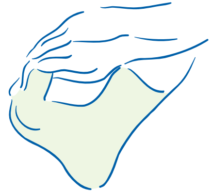
Figure 3. Stretching the foot muscles slightly further