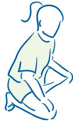
Figure 2. Stretching the foot muscles