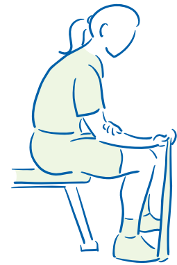
Figure 2. Strengthening the wrist flexor muscles