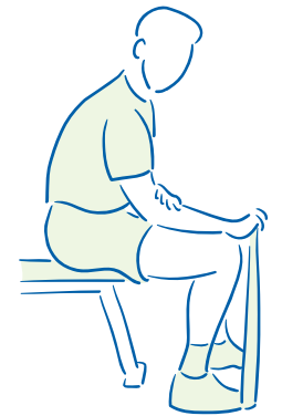
Figure 3. Strengthening the wrist extensor muscles